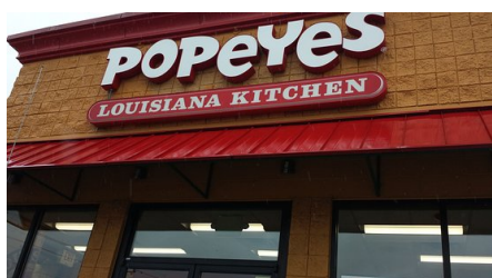
Popeye's Louisiana Kitchen