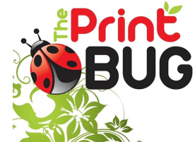
The Print Bug