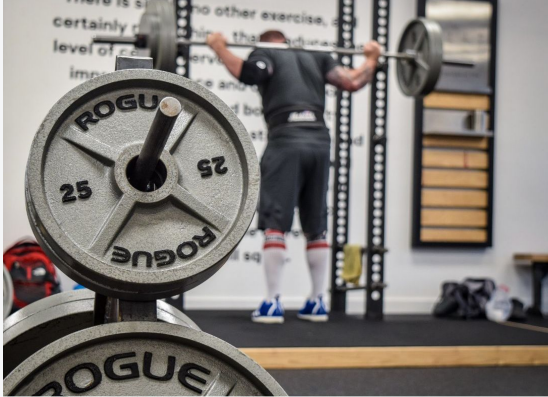
Starting Strength CINCINNATI

designed to safely and efficiently improve strength, health and athletic performance making the entire body stronger and improving overall health. Members at Starting Strength follow a personalized training program in a small group format with world-class, highly regarded coaches.